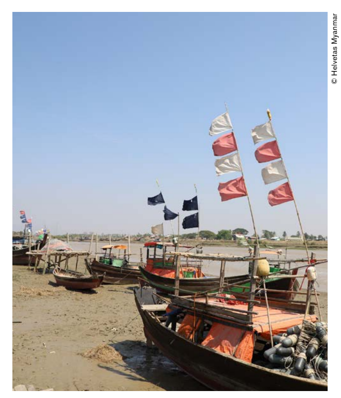
Fishing boats along the Bilin River, Bilin, Mon State

With the cessation of any cooperation with the government from February 2021 onwards, the project re-focused on community-led conservation rather than supporting the establishment of township or higher-level conservation bodies. Humanitarian assistance, started during the COVID-19 pandemic, was also increased in 2023 to support the recovery of livelihoods affected by flooding. A key focus of the last phase was to build the capacities of the locally led institutions that the project has supported to ensure that they will continue to operate beyond the project lifetime. For associations, this was complicated by a Law of Association introduced by the military government in November 2022 that required all existing associations to re-register. However, appropriate solutions were found.