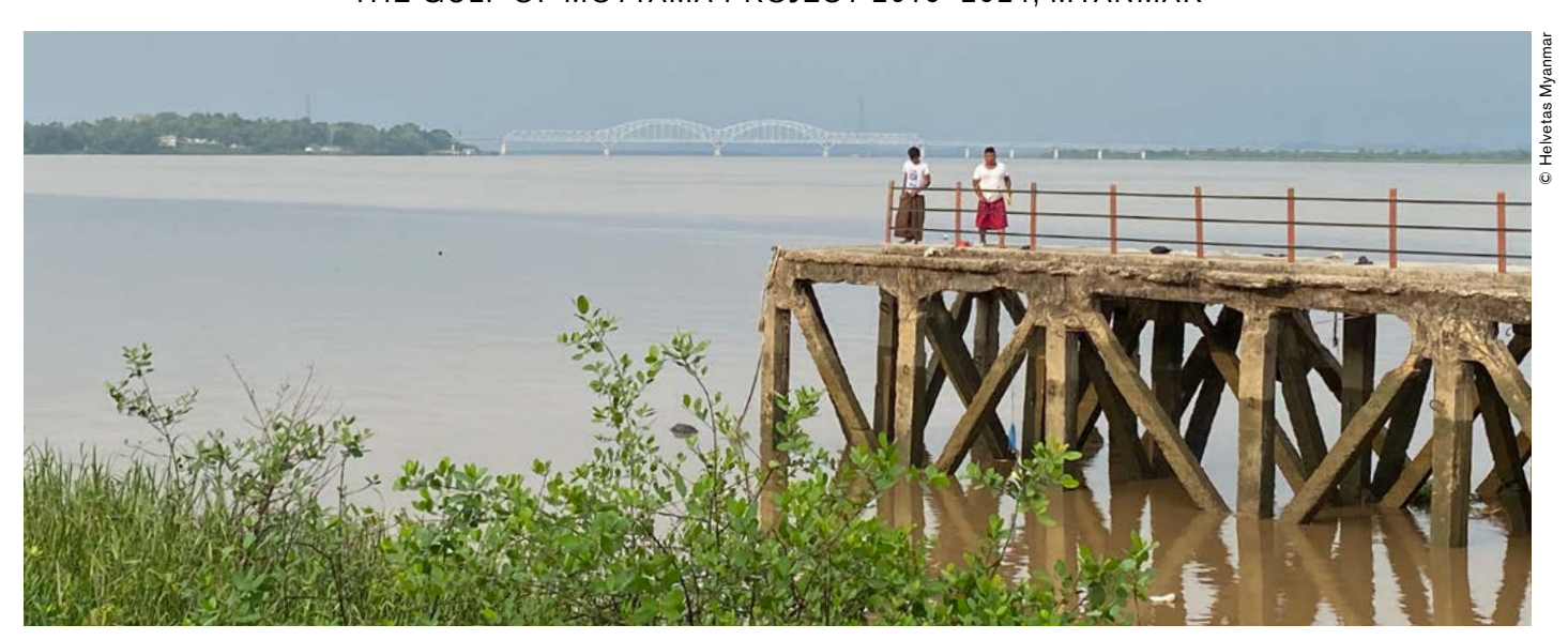
The bridge over the Salween River where the river flows to the sea, Mawlamyine, Mon State