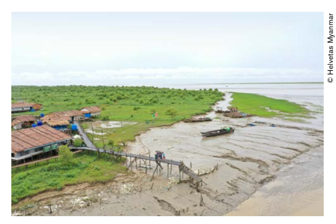
Ariel view of mangrove forest in crab island, Aung Kan Thar village, Thaton, Mon State