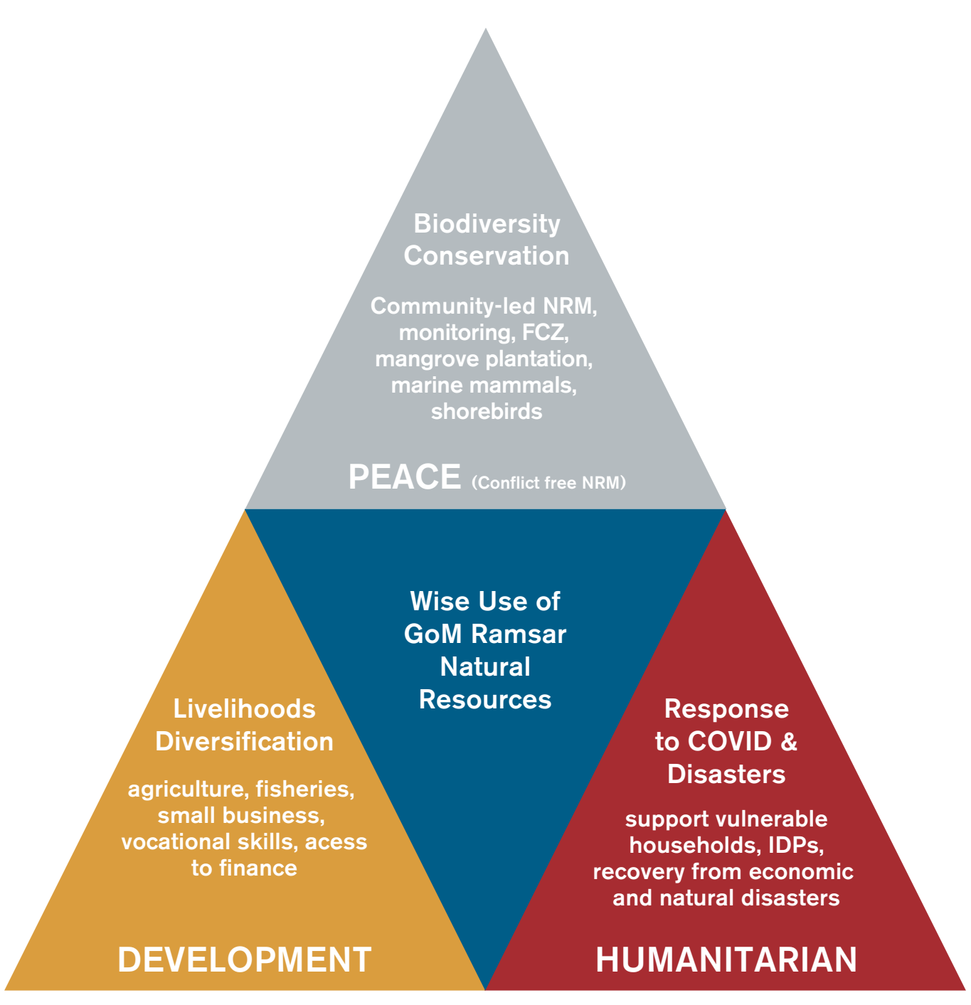
The Triple Nexus Approach in GoMP

The project is adapted and implemented using a triple nexus approach, which utilizes the combined expertise and interlinkages between sustainable development, peace and conflict mitigation, and humanitarian actions, as shown in the figure below.